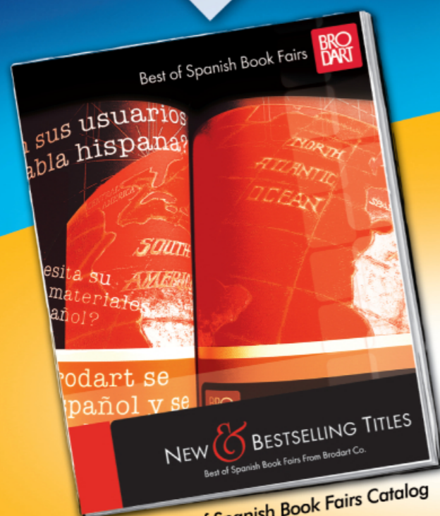
2007 Best of Spanish Book Fairs Catalog

(Brodart speaks Spanish and offers the best in Spanish-language material.)